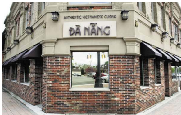
ABOVE: A 1924 bank building that was most recently a photo studio is the new home of Da Nang.